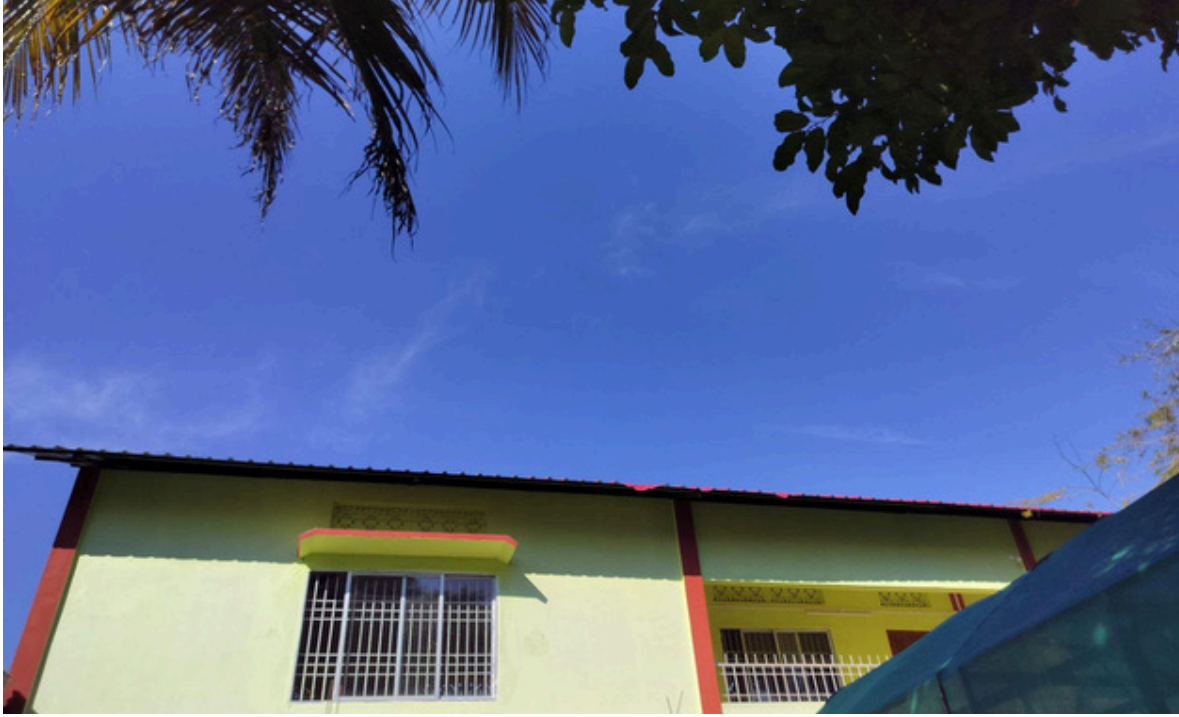
Photo 2: New Building PG Classes donated by Dharmeshwar Konwar, MLA